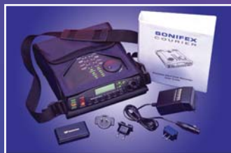
Courier with standard accessories

Sonifex is a BABT approved manufacturing facility with a licence to build telecommunications equipment and all telecom products are compliant with BS6301, BS7002, BS415 and CTR21.