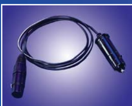
CO-CGR 12V Cigarette Lighter Adaptor