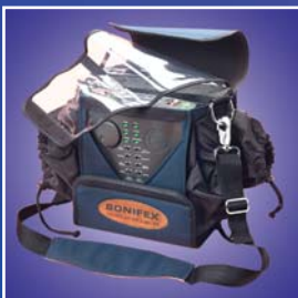
CO-PRO Sound Recordists Bag