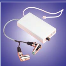
CO-TBU Telephone Balance Unit